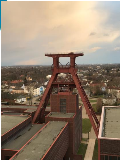
Ruhr Museum at Zeche Zollverein