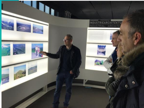
At Ruhr Museum: a guided tour through the Ruhr areas' structural change and polluted past