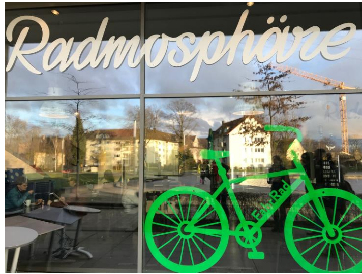
Katrin Knur illustrating plans and built route of Germany's first bike high way RS1 at Café Radmosphäre